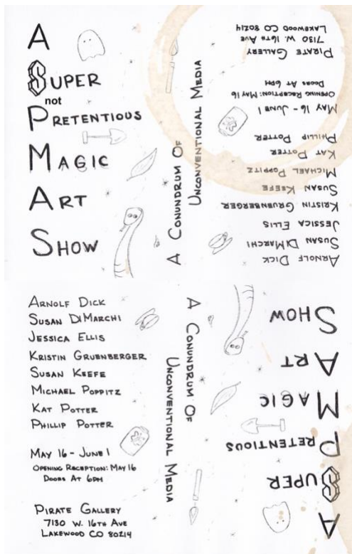
Kat and Phillip Potter, A Neo-Artifact Throwback to 90s Underground Zine Subculture, Show Card , 2025, simulated photocopy on paper, 5.5in x 8.5in